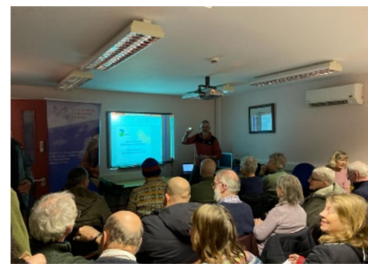
Some of the audience at our SFS event in Letterston

In early 2024, we wanted as many people as possible to respond to Welsh Government's Sustainable Farming Scheme public consultation, and for them to speak up for Welsh wildlife and our farming communities from a well-informed position, not one based on misleading media headlines.