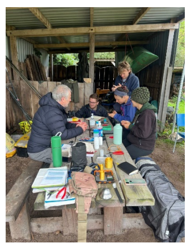
Some of the participants at the 2024 Welsh Ringing Course

We would dearly like to see many more applications received for our various grants and bursaries. Please visit <a href="https://birdsin.wales/grants-awards/">https://birdsin.wales/grants-awards/</a> for more information.